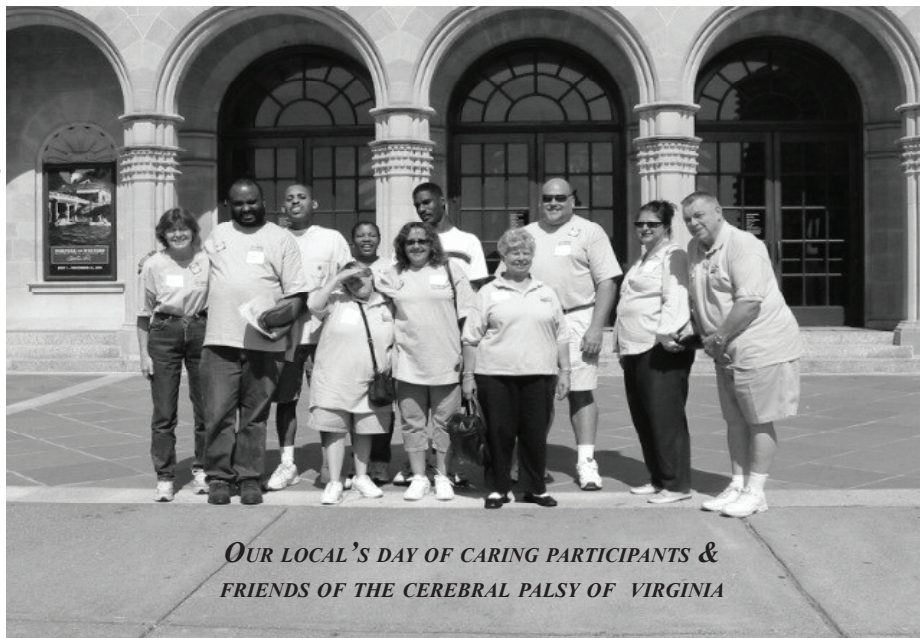
OUR LOCAL'S DAY OF CARING PARTICIPANTS & FRIENDS OF THE CEREBRAL PALSY OF VIRGINIA

You may also e-mail pcmose@msn.com if you have additional questions.